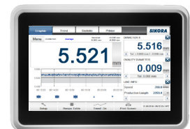
ECOCONTROL 600 with 10" monitor