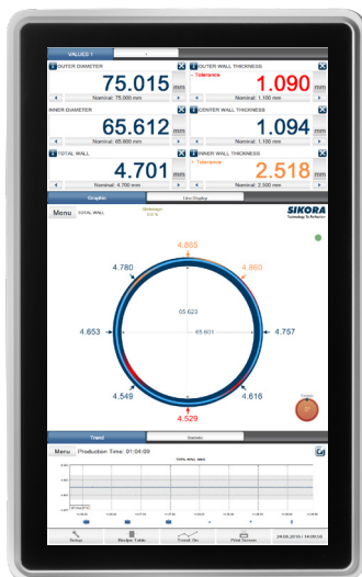
ECOCONTROL 6000 with 22" monitor

All ECOCONTROL processor systems contain a time or length related trend diagram for all values, combined with a graph of the distribution of the single values (statistical distribution curve), and a comprehensive statistic with the minimum, maximum and mean value, standard deviation, Cp and Cpk values. The operation is intuitive with the menu-driven touch screen.