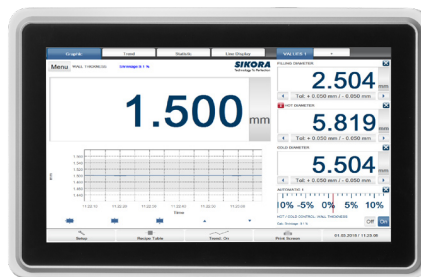
ECOCONTROL 1000 with 15" monitor