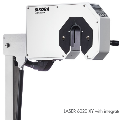
LASER 6020 XY with integrated display