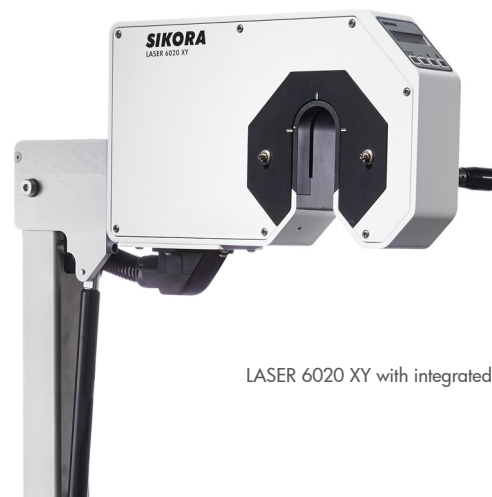
LASER 6020 XY with integrated display